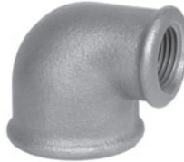
Γωνία 90° θηλυκή συστολική