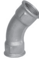
Καμπύλη 45° θηλυκή