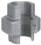
Ρακόρ κωνικό θηλυκό