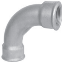
Καμπύλη 90° θηλυκή