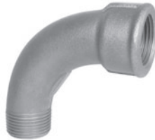
Καμπύλη 90° αρσενική-θηλυκή